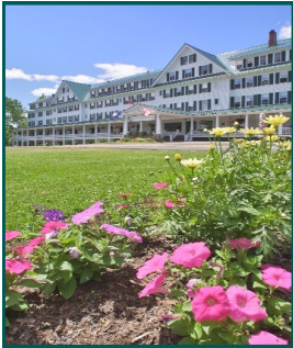
The Historic Eagle Mountain House, established in 1879

Today's course was converted in 1931 from pasture land once used by grazing farm animals at the neighboring Eagle Mountain House. The USGA par-32 rated course now features a small pro shop, a beautiful driving range, and