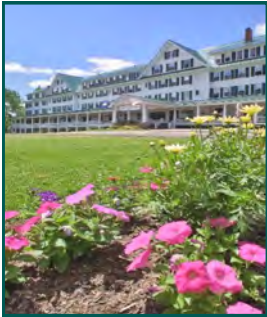
The Historic Eagle Mountain House, established in 1879

Today's course was converted in 1931 from pasture land once used by grazing farm animals at the neighboring Eagle Mountain House. The USGA par-32 rated course now features a small pro shop, a beautiful driving range, and